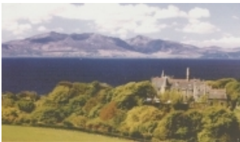
This is the view we are told - but we haven't seen it yet 'cos of the fog !!