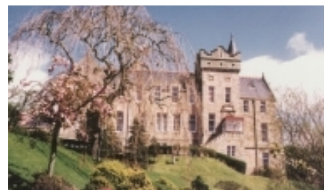
The YWAM Seamill Centre

We have just heard that we are going to Mongolia in April/May. The details are a bit sketch at this stage - plenty of planning to do!